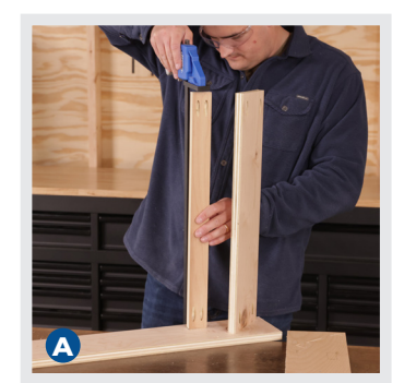
A Clamp Reel Support Brace to Side Board using reference lines to align pieces